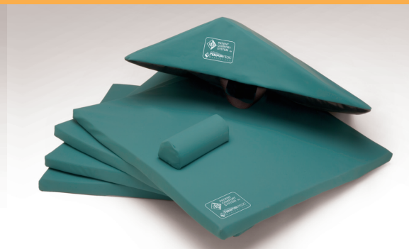
Permanent Antimicrobial Agent

For a free sample, call (866) 943-7727 PatientComfortSystems.com