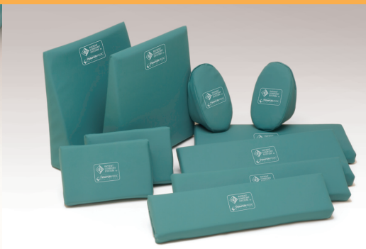
Complete Range of Solutions